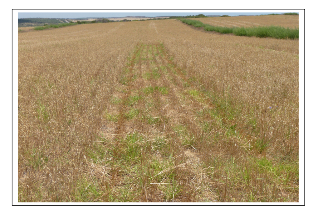
Fig. 2. Pasture cropped paddock on Keith Tunney's property east of Dongara, WA, showing the summer-green perennial pasture beneath a harvested strip of winter oats, sown between alleys of tagasaste. The House of Representatives Standing Committee on Primary Industries and Resources visited this property in September 2009 as part of the Federal Government inquiry into Adapting Farming to Climate Change.

Established summer-green perennial grasses can be oversown with annual grain crops such as wheat, barley, triticale, oats, lupins, chickpeas or canola during their dormant winter phase (Fig. 2). For grazing purposes, mixtures of several crops (eg cereals and legumes) can be sown simultaneously (cocktail cropping) to enhance biodiversity and animal nutrition.