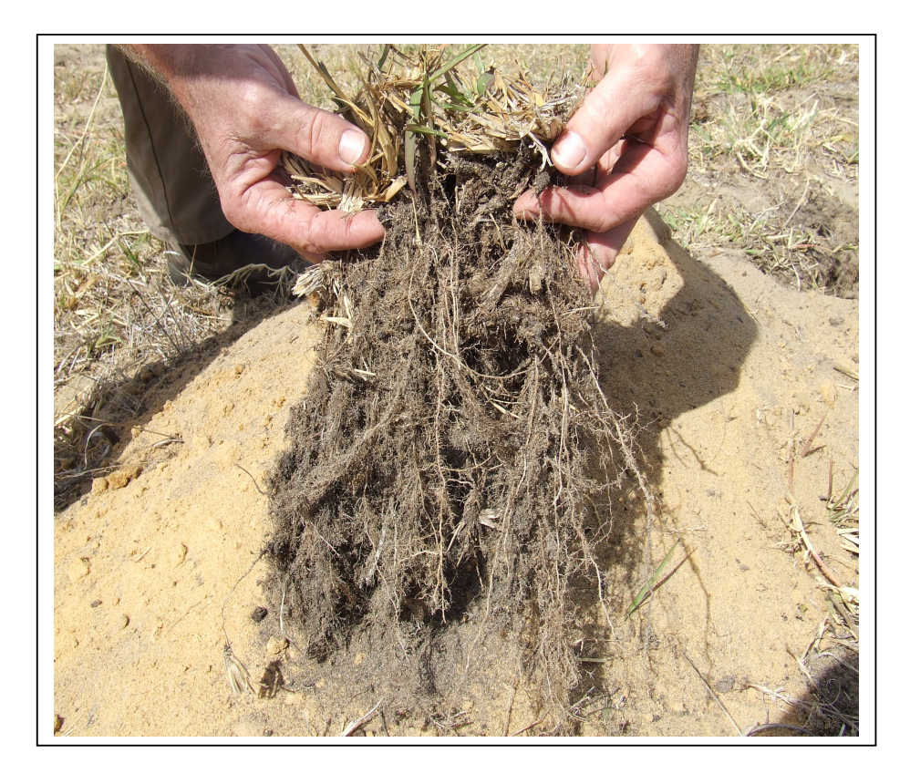
Fig. 1. The dark coloured carbon sequestered around the roots of perennial grasses is readily observed in light coloured soils.

Provided the microbial bridge is intact, organic carbon additions are governed by the volume of plant roots per unit of soil and their rate of growth. The more active green leaves there are, the more healthy roots there are, the more carbon is exuded. The breakdown of fibrous roots pruned into soil through rest-rotation grazing can also be an important source of carbon in soils.